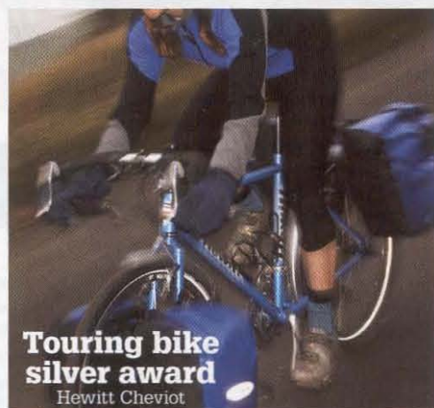
Touring bike silver award Hewitt Cheviot

Lastly, since riding this month's gorgeous Gansaari, I've been reawakened to the simple pleasures of the fixed wheel. This baby is super smooth and serene, and for the winter commute there's simply no other way.