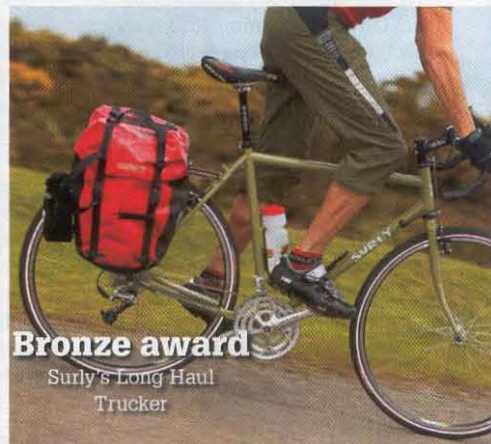
Bronze award Surly's Long Haul Trucker